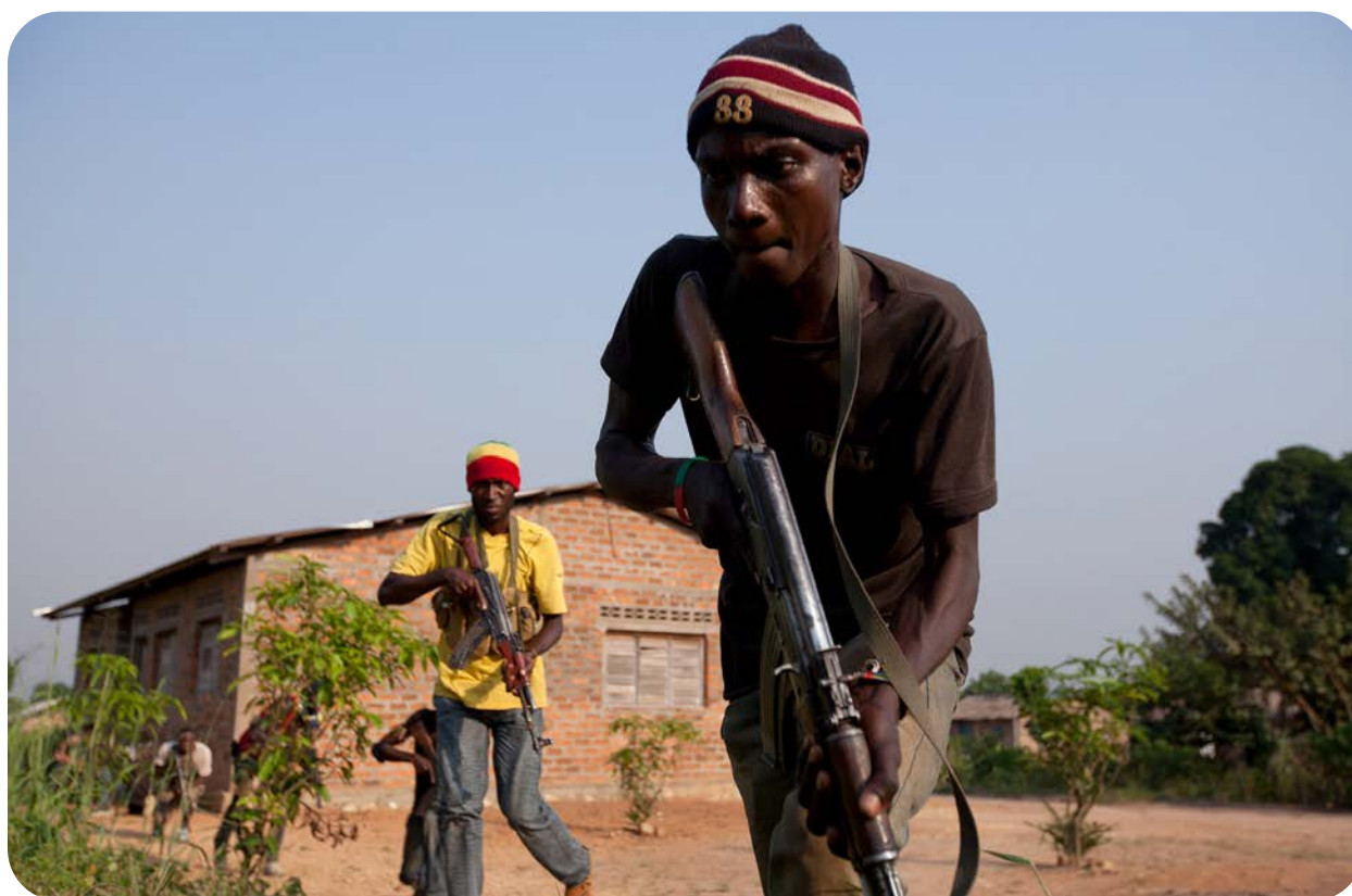
“Central African Republic Crisis” by Ivan Lieman is licensed under CC BY-NC 4.0

The Central African Republic is ranked among the world's most fragile states and among those most vulnerable to climate change.