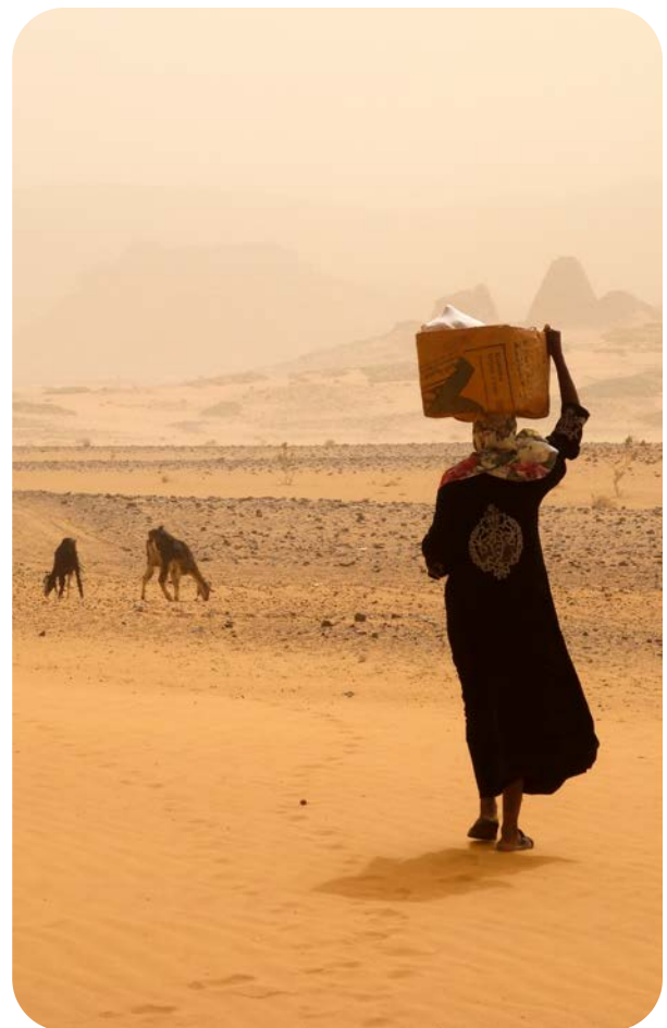
Sudan is ranked among the world's most fragile states and among those most vulnerable to climate change.

In these countries, it can be difficult to prioritize action to respond to climate change. However, it would be a mistake to neglect medium- and long-term adaptation needs in these contexts. The National Adaptation Plan (NAP) process offers an important opportunity to align and integrate adaptation planning and peacebuilding processes. This briefing note will explore the importance and difficulties of bringing these two agendas together in contexts of fragility and instability. It will also take a look at some of the countries that have already begun to integrate conflict considerations into their adaptation planning processes. Addressing and integrating these agendas will be especially vital for the sustainable development of fragile states and regions that are seeking to prevent, stop or recover from conflict.