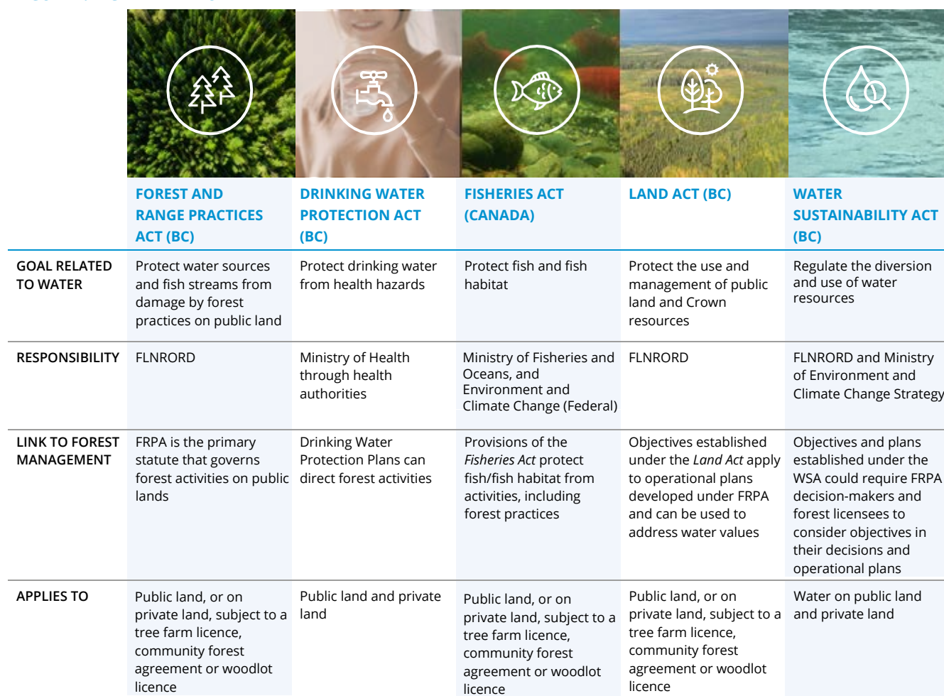
FIGURE 1. LEGAL FRAMEWORK TABLE

Five primary statutes related to water have implications for forest management in BC. Figure 1 illustrates elements of these five statutes that govern forest practices and the conservation, management, and use of water in BC: FRPA, the Water Sustainability Act (WSA) , the Drinking Water Protection Act (DWPA) , the Fisheries Act and the Land Act . In addition, the Environmental Management Act pertains to the regulated discharge of pollutants into water.